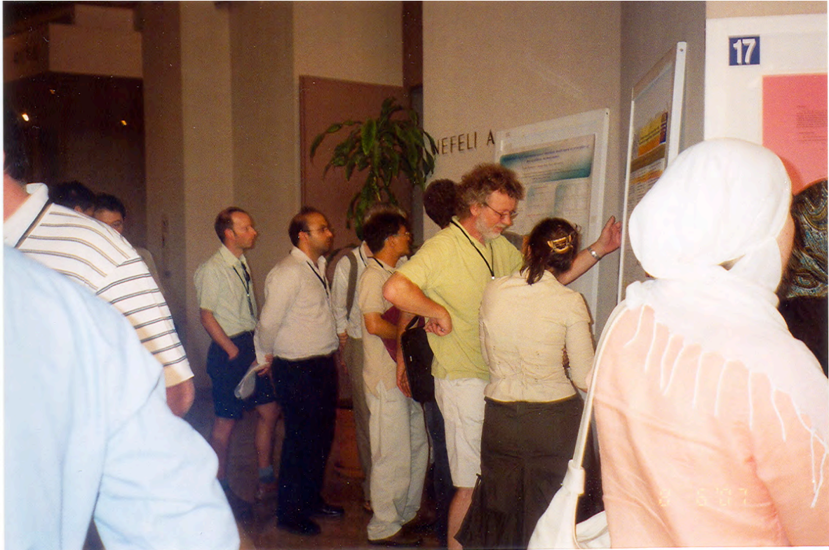
Picture 3. Delegates during the poster session of the Workshop.