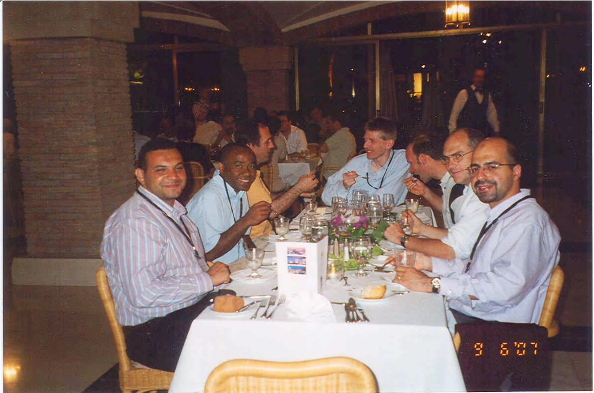
Picture 5. Delegates during the banquet of the Workshop.