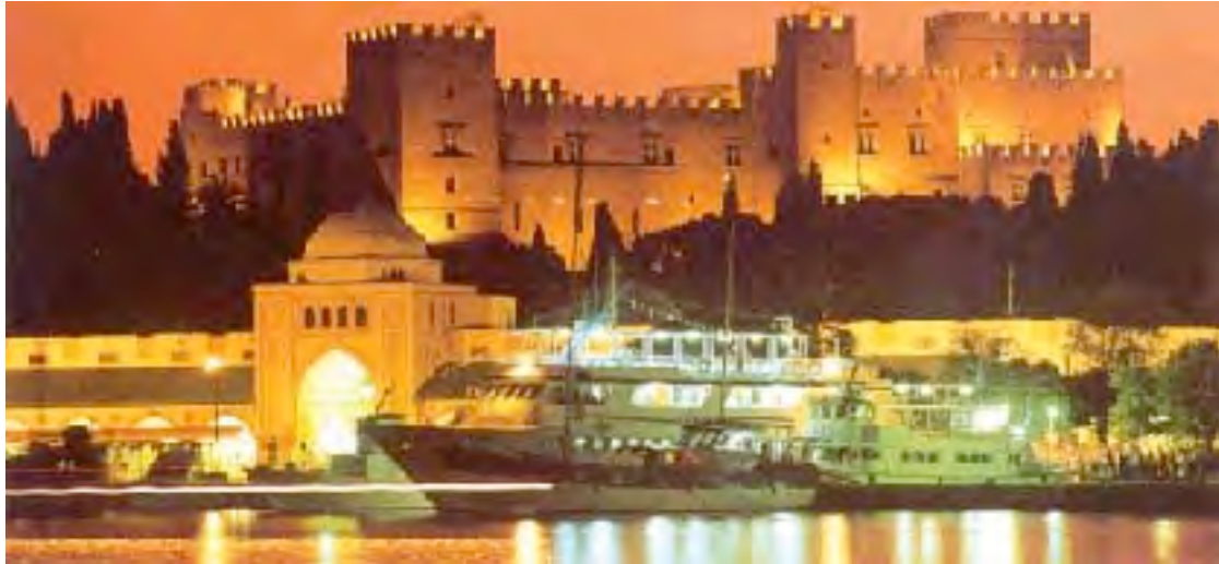
Picture 1. Rhodes Island, Greece, was the meeting place for the XVth International Workshop on Numerical Methods for Non-Newtonian Flows, June 6-10, 2007. Pictured is the harbor with the Medieval Castle in the background.

The XV th International Workshop on Numerical Methods for Non-Newtonian Flows (XV th IWNMNNF-2007) was held on the island of Rhodes, Greece, together with the 5 th meeting of the Hellenic Society of Rheology, in June 6-10, 2007. Since their inception in 1979, in Providence, Rhode Island, USA, the workshops are rotated biennially between North America and Europe. This was the first time the meeting was held in Greece. Rhodes Island was a proper destination, as the meetings have come a full circle after almost 30 years of frantic activity, which have seen workshop meetings in castles, lakes, islands, seashores, etc. Rhodes, as the capital of the Dodecanese Islands, combines all of the above, and has been a place of tourism and holidays since antiquity.